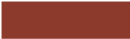
Barn Red SMP SR .32 TE .834 SRI 31.8